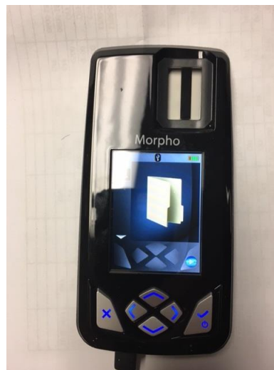
Hand Held Fingerprint Scanner